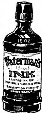
Pint with Pour-Out. Packed 6 to Carton. Shipping Wt. 15 lbs.